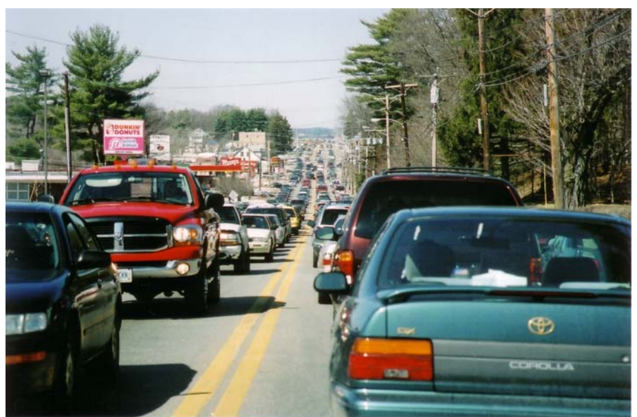
The Salem traffic-jam.

On the Van shot, I set the camera to "partial metering" which is a broader version of spot metering with the camera aimed at the side of the van (door open). Alan Jr. did this shot. As you can see the background is somewhat overexposed to accommodate some bracketing for the wide variation of lighting. I'm somewhat satisfied with that test. Now it's off to Salem.